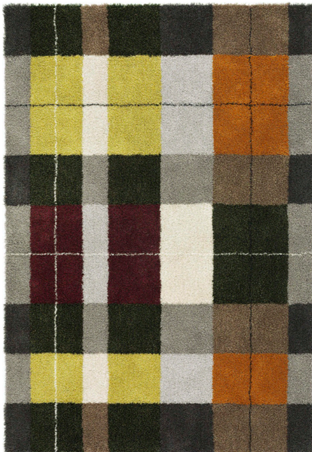
Stubb – Tartan

Argyle and Tartan , designed by Gunilla Lagerhem Ullberg, are hand tufted in a combination of wool and linen in confident colours, using our fine Stubb pile as a demonstration of the unlimited possibilities that the tufting method and Kasthall's atelier can offer to create unique patterns and colour combinations. This long-pile rug and exclusive wall-to-wall carpet is luxuriously deep and has a soft, vibrant surface. It is unpatterned, but comes in a wide palette – from bold colours to soft pastels – so it works well in most settings. The mix of linen and wool in various shades creates a beautiful sheen and marbled effect.