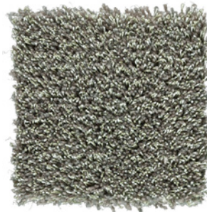
Sage Grey 5001