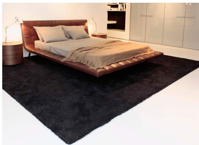
Poliform Showroom New York

Showrooms in MILAN • NEW YORK • STOCKHOLM • GOTHENBURG