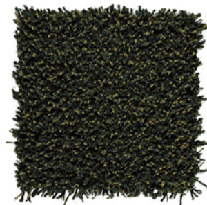
Racing Green 3002