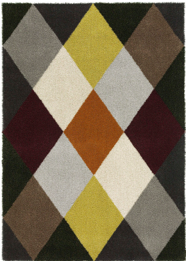
Stubb – Argyle