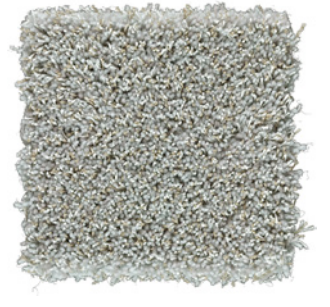
Silver Grey 5002