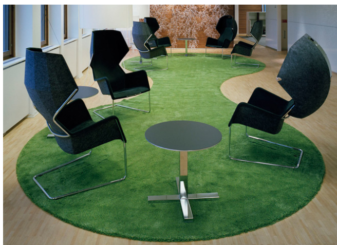
Wistrands Law firm, Stockholm – Stubb custom made shape and colour

Argyle and Tartan , designed by Gunilla Lagerhem Ullberg, are hand tufted in a combination of wool and linen in confident colours, using our fine Stubb pile as a demonstration of the unlimited possibilities that the tufting method and Kasthall's atelier can offer to create unique patterns and colour combinations. This long-pile rug and exclusive wall-to-wall carpet is luxuriously deep and has a soft, vibrant surface. It is unpatterned, but comes in a wide palette – from bold colours to soft pastels – so it works well in most settings. The mix of linen and wool in various shades creates a beautiful sheen and marbled effect.