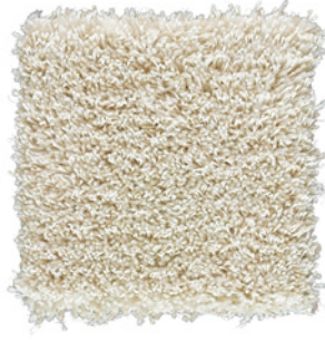
Almond Milk 8001