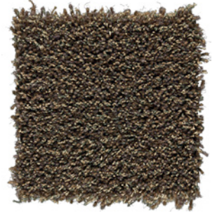
Khaki Beige 7001