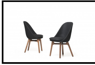
750 SOLO DINING CHAIR