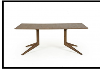
341F LIGHT RECTANGULAR TABLE