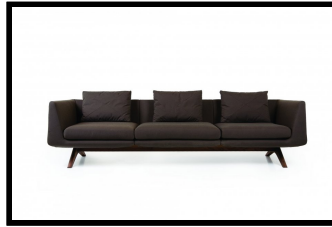
350 HEPBURN MODULAR SOFA